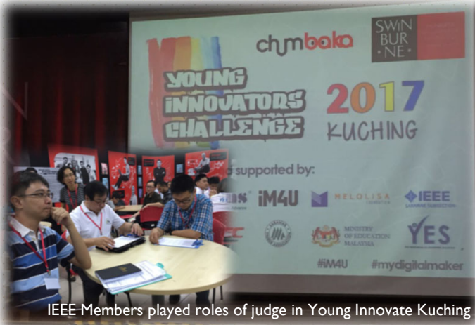
IEEE Members played roles of judge in Young Innovate Kuching

Young Innovate Challenge is an annual STEM competition for secondary school students. It was held on 8 July 2017, and technically sponsored by IEEE Sarawak for the second time. IEEE members joined the event as panel judges to evaluate the students' work.