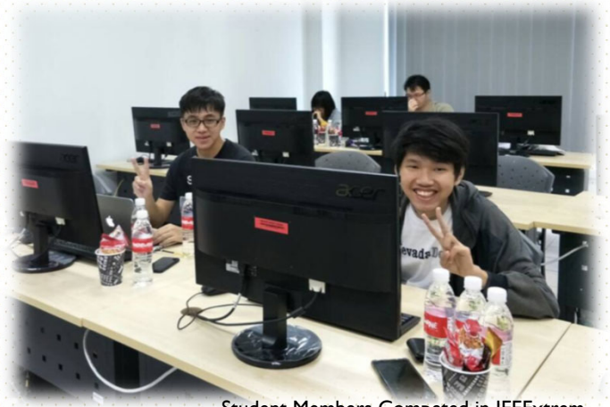
Student Members Competed in IEEEExtrem

The result of the IEEEExtrem 2017 Malaysia can be found here