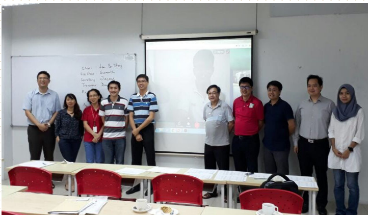
The 2017 EXCOMM of IEEE Sarawak Subsection