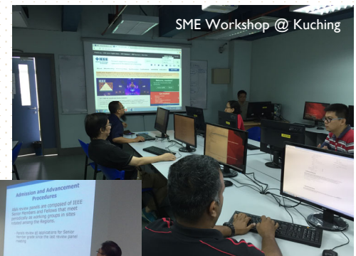
SME Workshop @ Kuching